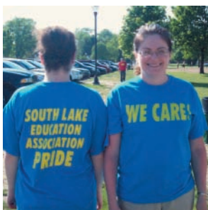
(May Enough is Enough Rally) South Lake tee shirts say it all!