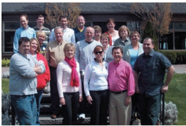
MEA-NEA Local 1 Presidents 2010